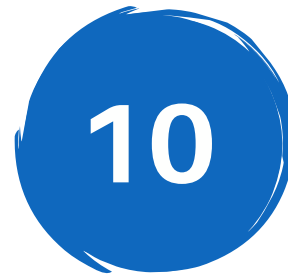
High School Students