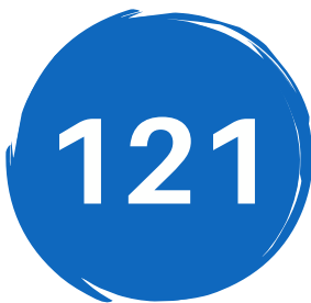
High School Tutoring