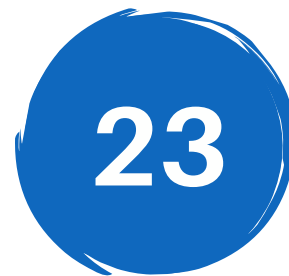
Women Literacy Program